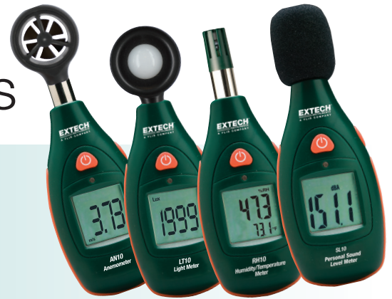
AN10 Air Velocity

Convenient pocket-sized meters are easy to use with one-button operation and can be stowed in a compact space such as a pocket. Models available for Air Velocity, Light, Humidity/Temperature, and Sound Level measurements. Keep one handy for whenever you need to take a quick environmental measurement.